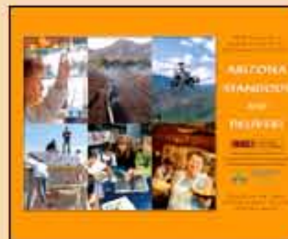
The Arizona Lottery was proud to be a part of the Governor's Regional and Rural Development Conference

The Lottery was proud to be a primary sponsor of the Governor's Regional and Rural Development Conference that was held late last month in Litchfield Park. In her welcome, Governor Brewer noted the conference "...provides tools and information to help each rural community and region attain a diverse and sustainable economy. With the creation of quality jobs and a plan for responsible growth, we can preserve the many distinct qualities of our rural and regional economic areas by preparing for our economic recovery." This year, attendees learned about grants, finance programs and technical assistance available in Arizona, the impact of the 2010 Census on community planning, and reviewed Arizona's utilization of stimulus funds to create jobs.